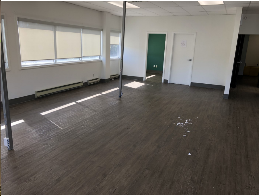
Meeting Room off Open Area