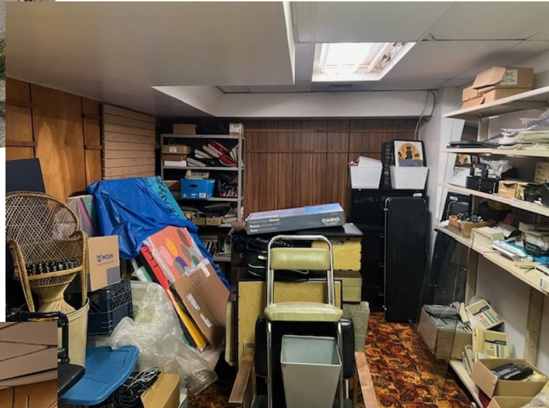
Lower Level Storage